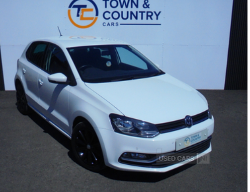
Jan 2017 Polo 1.0 75 Match 5dr